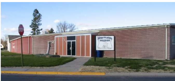
High Plains Museum

Each museum has its own atmosphere and at The High Plains Museum it is about pioneer life and adapta-